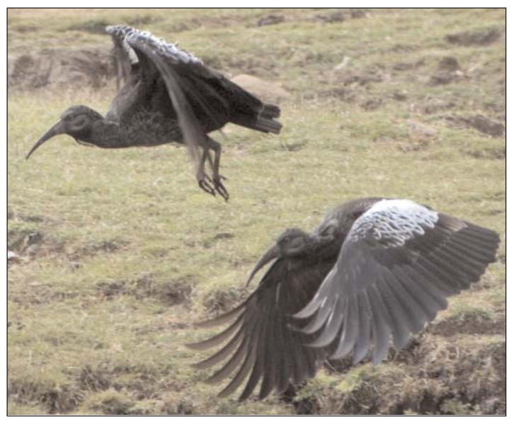
The endemic Abyssinian Wattled Ibis - in Meket (Alison Judd)

Look out for a new British Council publication coming out in November: Perspectives Ethiopia & Britain with a section about the TESFA work.