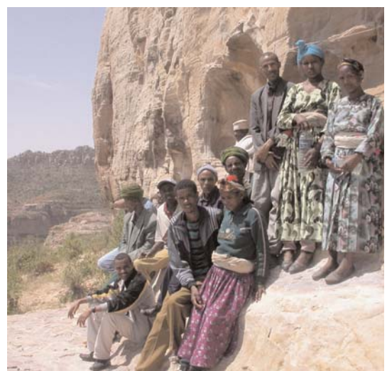
Meket staff outside a Rock church in Tigray