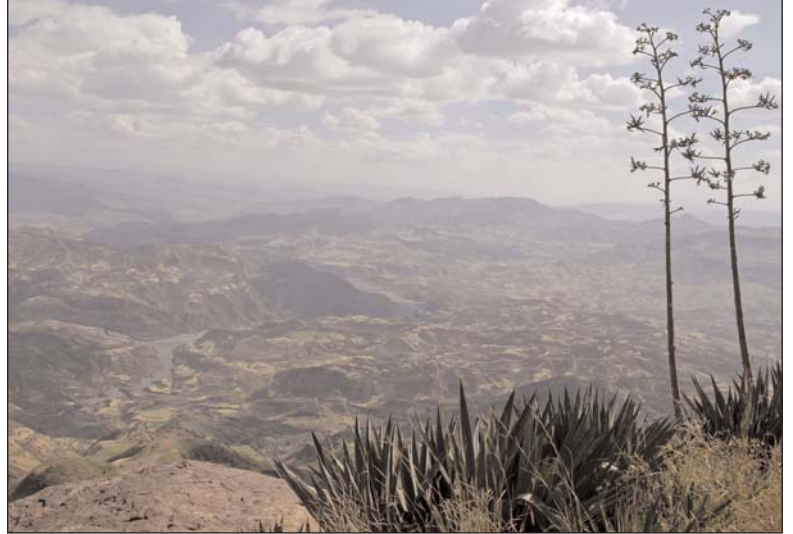
View from Mequat Mariam

Last season (July'06-June'07) the Meket Community Tourism Enterprises (CTEs) made significant profits -Mequat Mariam 21,644birr (over $2,500US), Wajela 18,143birr, Aterow 10,609birr and Yadukulay which hosted its first guests in June'07 made 524birr after covering its costs. (More details on Page 3).